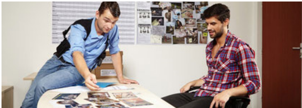
The literature on media references instances in which the use of dolls cleared a suspect or resulted in lesser charges.

Third, even when the dolls support an accusation a child has been sexually abused, they may clarify the exact nature of the sexual touch and ensure a suspect is charged only with his or her actual crimes (e.g. sexual touching and not penetration). In one case, a child verbally described sexual abuse using slang terminology suggestive of anal intercourse. However, the child went on to describe the offender as having ejaculated on the boy’s stomach. Since these verbal accounts appeared incongruent, the interviewer asked the child to demonstrate the contact with anatomical dolls. The child demonstrated the perpetrator’s penis as going in between the boy’s legs from behind but not in the anal opening and the ejaculate therefore going on to his stomach. The perpetrator confessed to abusing the boy in exactly this way and pled guilty to the offense. 51 Without the dolls, the government may have charged the defendant with sexual penetration as opposed to sexual touching.